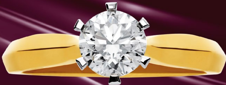
18ct One Carat Diamond Brilliant-cut Solitaire NZOC 0015

Please enquire about the wide range of customer finance options that we have available to offer you.