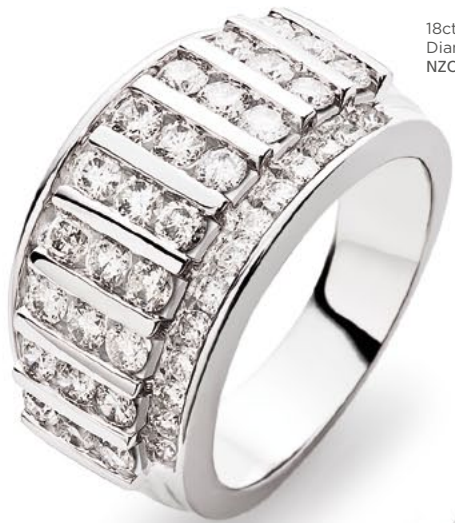
18ct Two Carat Channel-Set Diamond Band NZOC 0009