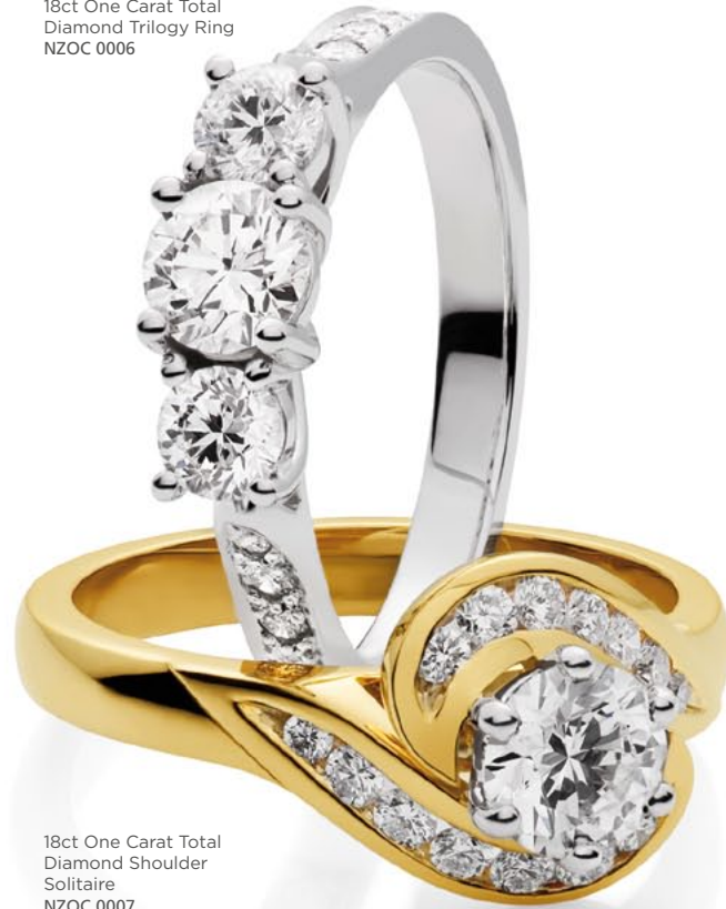
18ct One Carat Total Diamond Shoulder Solitaire NZOC 0007