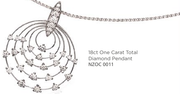
18ct One Carat Total Diamond Pendant NZOC 0011

Love conquers all. But everyone needs a little help, now & then.