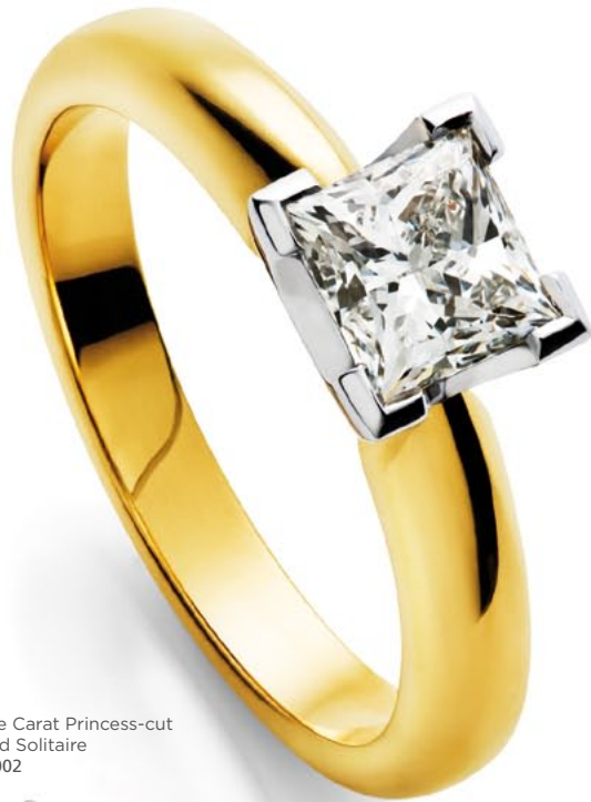
18ct One Carat Princess-cut Diamond Solitaire NZOC 0002

CANADIAN FIRE A Diamond True to Its Origin