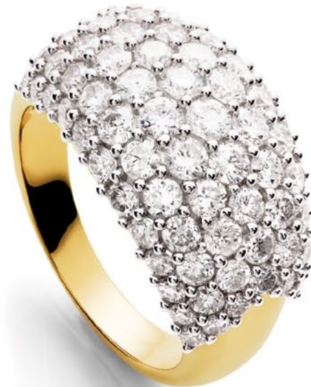
18ct Three Carat Pave' Diamond Band NZOC 0010