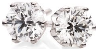
18ct One Carat TDW Stud Earrings NZOC 0012