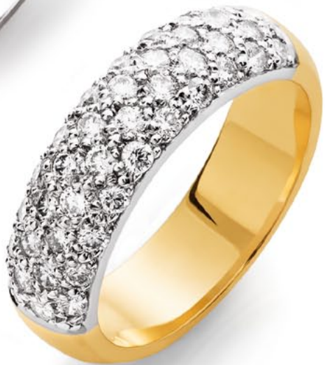
18ct One Carat Pave' Diamond Band NZOC 0008