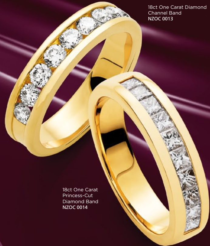
18ct One Carat Diamond Channel Band NZOC 0013

This special collection is available for a limited time only.*